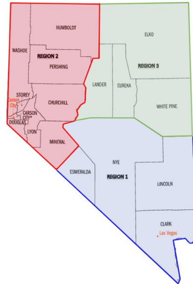
NEVADA REGION MAP

SOURCE: Nevada Division of Emergency Management (DEM), Nevada Department of Transportation (NDOT), Walker River Irrigation District, NV Energy, Nevada Department of Wildlife (NDOW), Lyon County Office of Emergency Management, and National Weather Service (NWS) Reno.